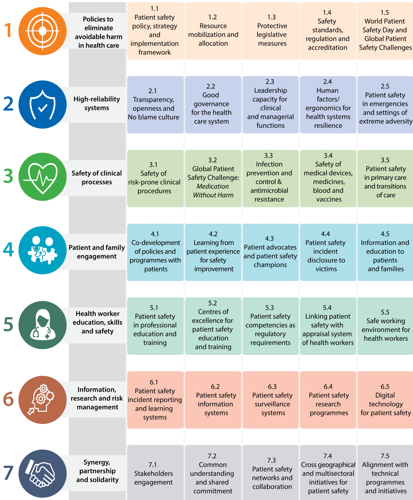
Figure 1. 7x5 matrix for the action framework.