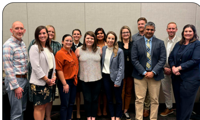
2023-2024 APLD Class at the 2024 ACCP Annual Meeting in Phoenix

The 2023–2024 ACCP Professional Leadership Development (APLD) class presented the results of their capstone projects and received their certificates in Phoenix at the 2024 ACCP Annual Meeting, concluding a year spent learning from current and former board members to expand their leadership skills, meeting with their mentors, and adding to their professional networks. Fifteen ACCP members completed the APLD program this year: